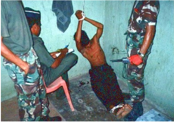
Indonesian troops torturing captive

The peaceful existence of the Republik Maluku Selatan (RMS) was abruptly violated with the naked aggression of the Indonesian Army...and this was immediately followed by a total blockade of the Maluku islands - assisted by Dutch naval vessels. Four months after the RMS Independence the Republik Indonesia proclaimed the Unitarian State of Indonesia on August 17th 1950.