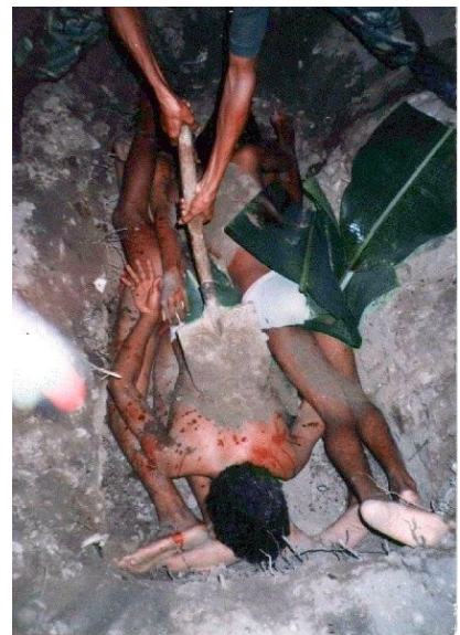
Indonesian troops bury their torture victims

On December 27th 1949 Holland transferred the sovereignty of its colonial empire to the 'United States of Indonesia', a then existing federation of 16 independent states. It was not long before the most powerful federal state - the Indonesia Republic, abolished by force the Federation and replaced Dutch colonialism with Indonesian neo-Colonialism. Aware of the imminent danger and conscious of the then Indonesian criminal President Sukarno's lust for expansionism, the Alifuru people demanded their own Maluku government take immediate steps to safeguard their freedom and right of self-determination; thus on April 25th 1950 - the Republik Maluku Selatan was proclaimed Independent. This proclamation of Independence was in full conformity with the international Agreements that were signed between the Dutch Government and all parties concerned - and to which the United Nations was a co-signatory.